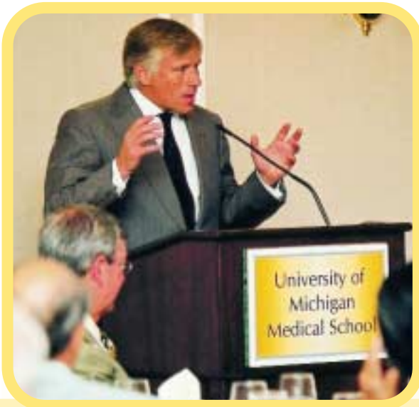
U-M President Lee Bollinger