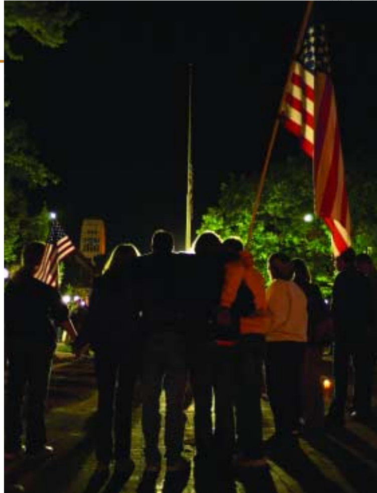
Candlelight vigil, U-M Diag, September 11, 2001

“The streets were closed. Police were guarding every intersection. Sirens echoed everywhere. We watched the news and tried to sleep. It was hard. We felt useless at work and guilty at home.”