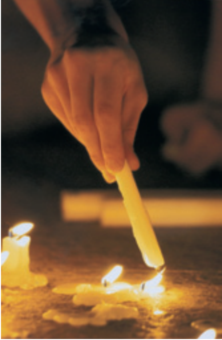
On September 11, a candlelight vigil was held on the Diag in tribute to those lost in the tragic events of one year ago.

to a significant issue for which we share great concern.