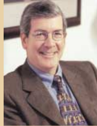
Allen Lichter was an early advocate of the lumpectomy approach to treating breast cancer and conducted one of the trials that found lumpectomy and radiation therapy to be as effective as traditional mastectomy treatment.