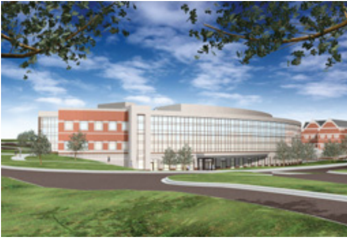
Architect's rendering of the Rachel Upjohn Building. Designed by Albert Kahn Associates, the 112,500-square-foot facility is scheduled for completion in 2006 and will be located near the East Ann Arbor Health Center. Eighteen U-M academic units, programs and institutes participate in the center's clinical, research and educational efforts; within the U-M Health System, the Depression Center collaborates with 37 centers, programs and medical disciplines.