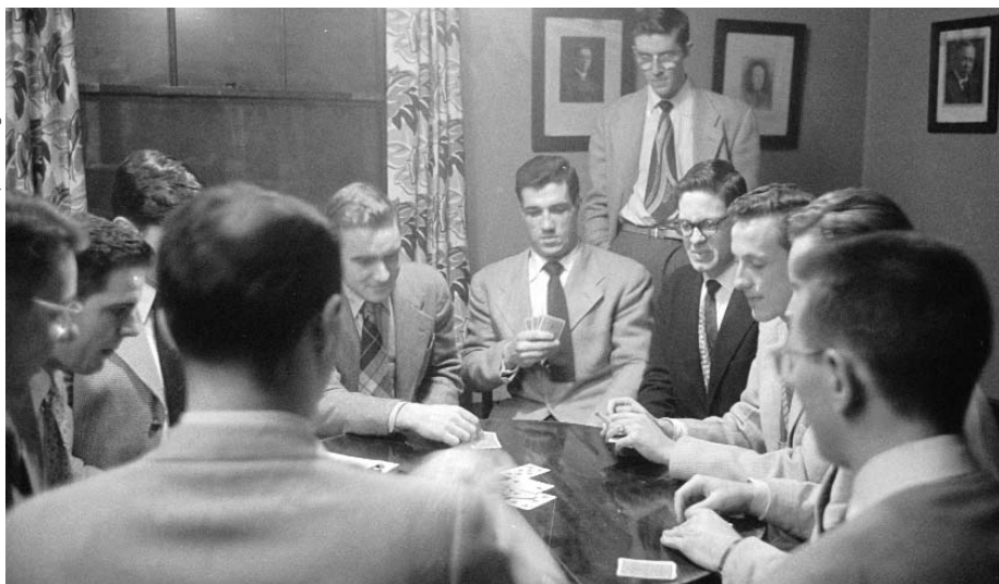
Medical students play cards at the Nu Sigma Nu fraternity house in 1950.