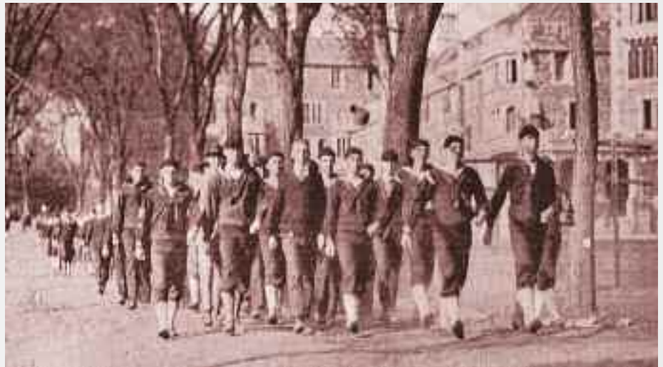
The Princeton Student Naval Training Corps in 1918. Princeton was one of the sites studied by Team Flu. From the The Princeton Bric-a-Brac , Vol. XLIV, June 1, 1919.

The agency was looking for evidence of the effectiveness of so-called non-pharmaceutical interventions (NPI) in slowing the spread and mitigating the damage of a devastating outbreak of